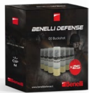
4 00 Buckshot