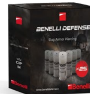
2 Slug Armor-Piercing