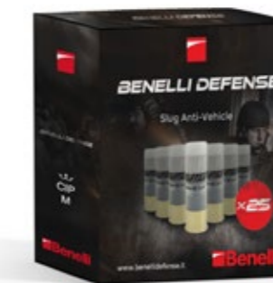
3 Slug Anti-Vehicle