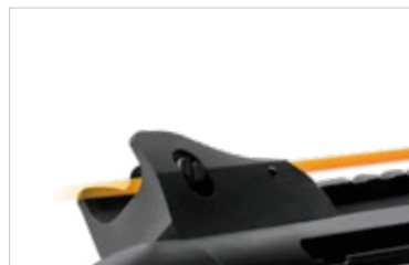
FIBER OPTIC GHOST RING SIGHT