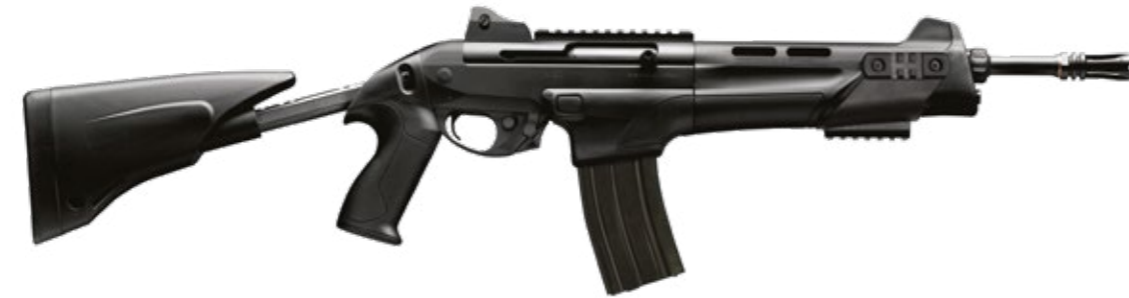
12,5"+2" TELESCOPIC STOCK

The MR1 is the first self loading semiautomatic rifle conceived from the ground up for police work; more versatile than a military firearm, it can be adjusted to the physical attributes and the special needs of the single operator.