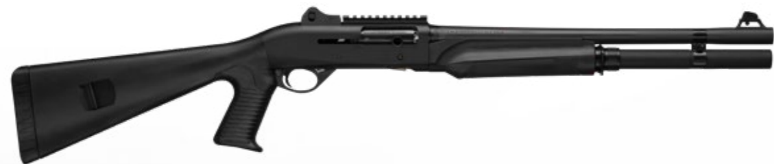
14" TELESCOPIC STOCK