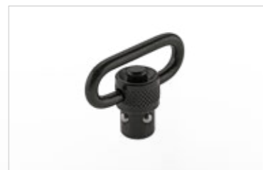
QD SLING SWIVEL