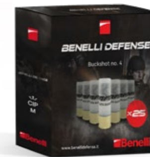
5 Buckshot no.4