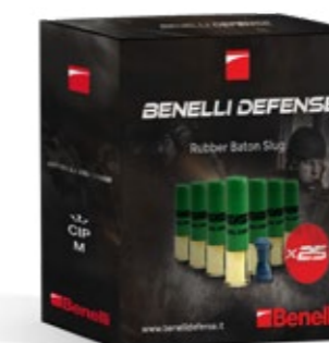
6 Rubber Baton Slug

1. Slug Classic Brenneke (3 times the stopping power of a 5,56x45 NATO and 2 times a 7,62x51 NATO or 7,62x39 Russian);