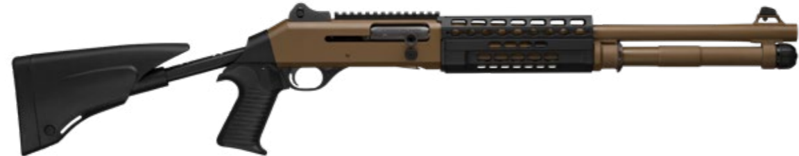
18,5" TELESCOPIC STOCK