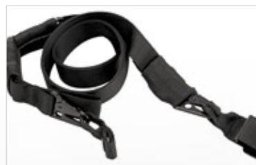
3 POINTS SHOTGUN STRAP