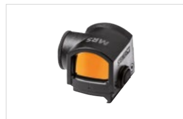
REFLEX SIGHT RED DOT