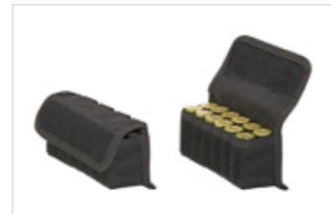
AMMO POUCH MOLLE SYSTEM