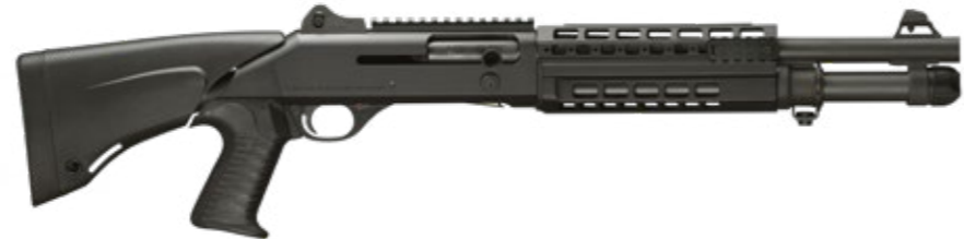
14" TELESCOPIC STOCK