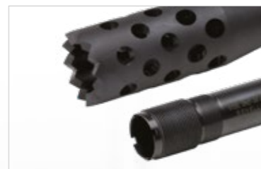
DOOR-BREACHER AND ADAPTOR