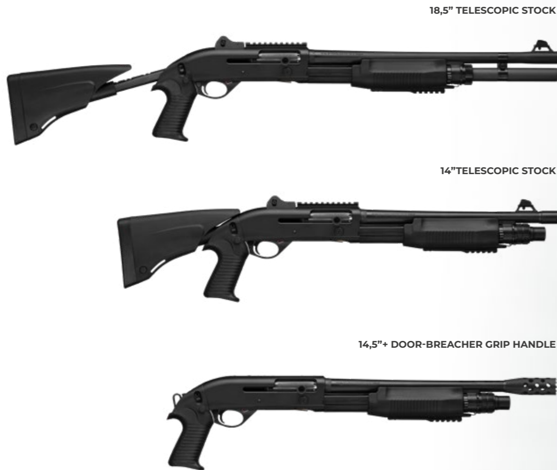
18,5" TELESCOPIC STOCK

The Inertia Driven® System was originally developed for Benelli semi-auto shotguns more than 40 years ago. Without ever needing adjusting, this system utilizes the energy from recoil to cycle anything from light field loads to heavy magnums with consistent reliability, year after year. There are Benelli shotguns that have fired over 500,000 rounds that are still functioning perfectly today. The Inertia Driven® System is simple with only three primary parts: the bolt body, the inertia spring and the rotating bolt head. Because gas, smoke and burnt powder residue are expelled out of the barrel, rather than being channeled into the gun's mechanism, Benelli guns shoot cleaner than any other shotgun. This allows them to be much easier to maintain, increasing reliability. With no springs, action bar linkage, or heavy gas cylinder under the forend, Benelli semiautos balance perfectly.