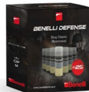
1 Slug Classic Brenneke