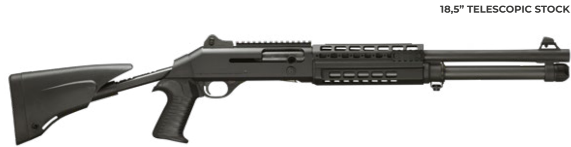
18,5" TELESCOPIC STOCK

In 1998, Benelli delivered five M4s to the Aberdeen Proving Ground in Maryland. These guns endured grueling tests for safety, function and performance, and exceeded stringent operational requirements. The M4 proved to be totally reliable in every test situation and was chosen as the new U.S. Joint Service Combat shotgun. Benelli's M4 Tactical is a unique Auto Regulating Gas Operated (A.R.G.O.) semi-auto shotgun, upon which the U.S. Marine Corps and US Department of Defense still depend today.