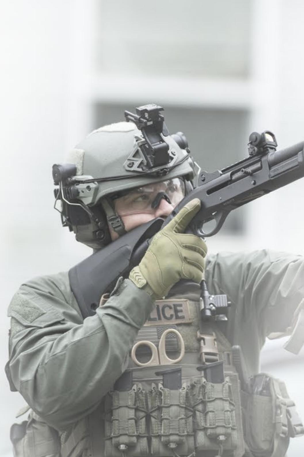
14,5"+ DOOR-BREACHER GRIP HANDLE

OPERATION Semiautomatic Auto Regulating Gas Operating GAUGE 12 CHAMBER 3" MAGNUM SAFETY Mechanic on trigger and automatic on disconnector CUT-OFF for rapid cartridge replacement and red cocked hammer indicator TRIGGER LOAD 2.500-3.250Kg / 30-36 N BARREL LENGTH (mm) 470 MAGAZINE CAPACITY 6 Magnum or 7 standard cartridges (+1 in chamber) MAGAZINE CAPACITY 4 Magnum or 5 standard cartridges (+1 in chamber) STOCK DISTANCE FROM TRIGGER (mm) STOCK OPEN 355 extended 237 retracted SIGHTS Ghost Ring Sights In Optic Fibre (Adjustable Rear/Fixed Front) Picatinny Rail STOCK in tecnopolymer telescopic stock, collapsible to 118 mm WEIGHT g (unloaded weapon) 3765 TOTAL LENGTH (mm) 1006 extended 888 retracted FINISH Black anodized receiver, hammered barrel Ni-Cr-Mo (inner Chrome lining/exterior phosphate coating)